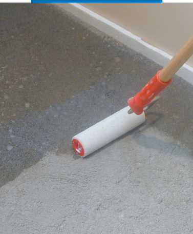
Applying Primer G with a roller