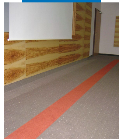
Example of Primer G applied before spreading on Ultraplan Eco and Rollcoll adhesive, used to bond carpet in a hotel room - Villa Hotel Castellani - Austria