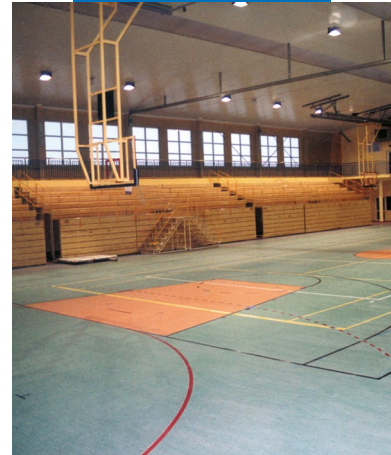
Example of Primer G applied before laying PVC and linoleum in a public gymnasium - Gdansk Orunia Indoor Gymnasium - Poland

All relevant references for the product are available upon request and from www.mapei.co.uk