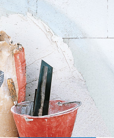
Use as a primer for gypsum plasters